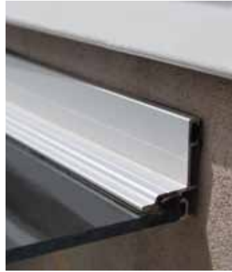
Back sealing gasket