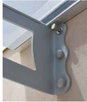
Complete wall mounting kit included