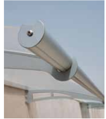
Anodized front gutter