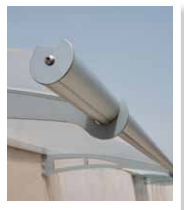
Anodized front gutter