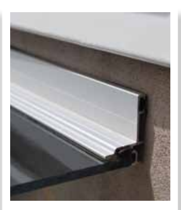
Back sealing gasket