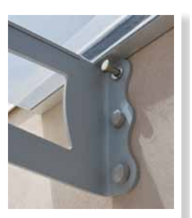
Complete wall mounting kit included