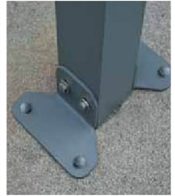
Anchoring kit included