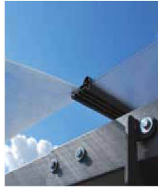
Sliding roof panel system