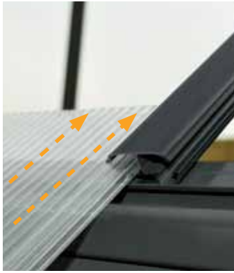
Sliding panel assembly system