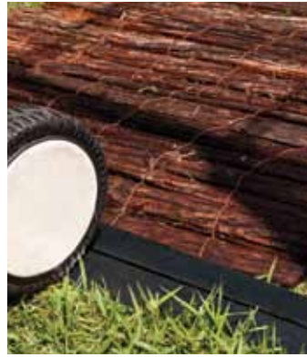
Wheelbarrow threshold ramp