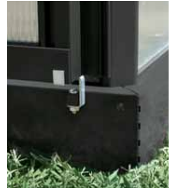
Galvanized Steel base and magnetic door catch included