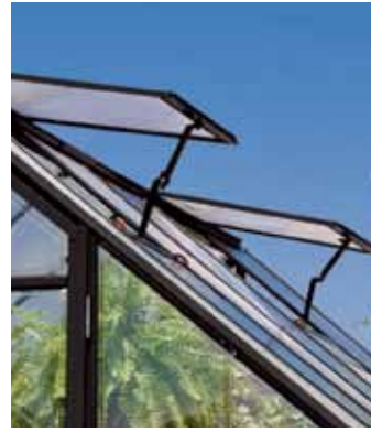
2 vent windows included