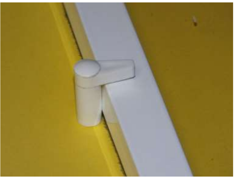
SMARTFIX suitable for windows from 0.3m wide x 0.3m high to 1.0m wide x 2.0m high.