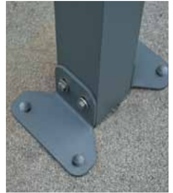
Anchoring kit included