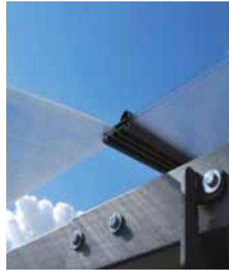
Sliding roof panel system