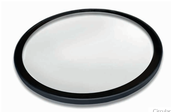
Circular or Custom Shapes