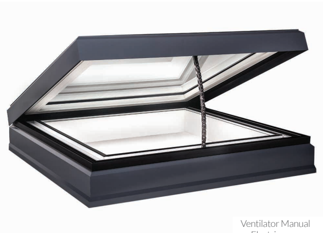
Ventilator Manual or Electric

The country's top design teams have previously chosen Lonsdale as the best available for prestigious and important buildings like the ones below: